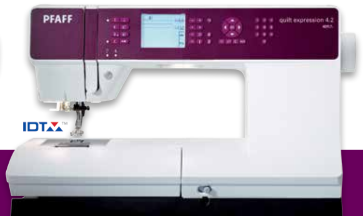
quilt expression™ 4.2